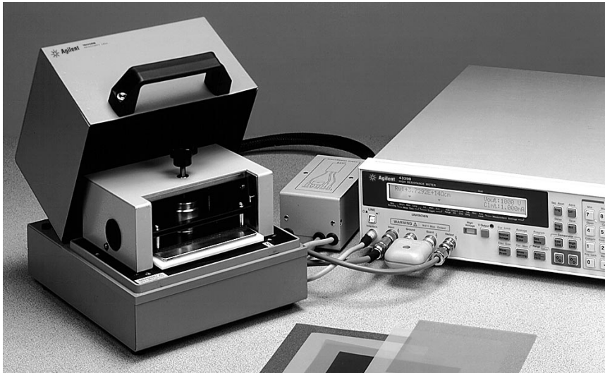
High Resistance Measurement Configuration (Agilent 4339B High Resistance Meter and 16008B Resistivity Cell)